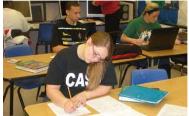
AHS seniors taking regional competitions.

• The Amelia Chapter of Business Professionals of America (BPA) competed in various software and skill competitions in January. These competitions test student's aptitude against schools in Hamilton, Clermont, Brown, Highland, and Adams County. We had 62 students participate in activity based and presentation format competitions such as: Fundamentals of Accounting, Payroll Accounting, Spreadsheet Applications, Database Applications, Presentation Management Individual, Prepared Speech, Administrative Research Project, Advanced Word Processing and Economic Research Individual and Team. Presentations required students to complete research for a paper and/or a PowerPoint presentation on defined topics from the National BPA organization, to fulfill the competition requirements and present them to judges on January 22. The other tests are objective and activity based on the particular area of the test. Students could take up to four tests. After our BPA awards ceremony on January 28, in the Amelia High School PAC we will know which students from our region will be competing at BPA state competitions in March.