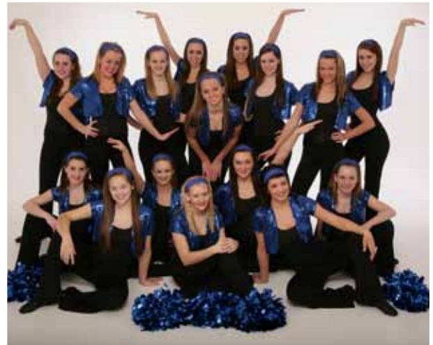
Amelia High School Dance Team.