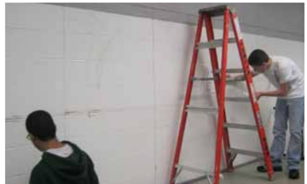
AHS Art Club members working on the mural on the Choir Room Wall.

• The Art Club at Amelia High School is growing every year. The Art Club is a wonderful group of creative, dedicated and kind-hearted students who spend at least an hour a week working on Visual Community Service projects within the school. Earlier this school year, they were asked to help create the set