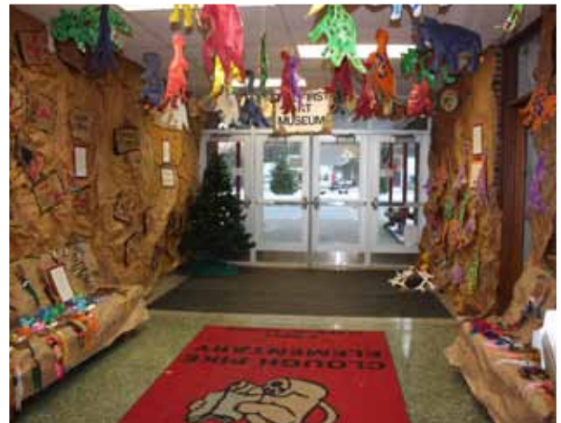
Clough Pike halls become "The Caves."