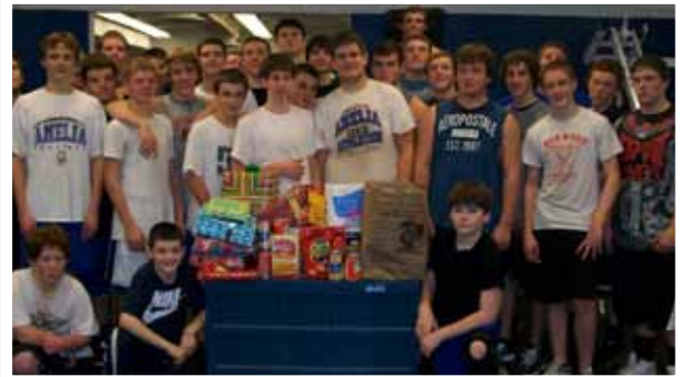
AHS football players support local families.