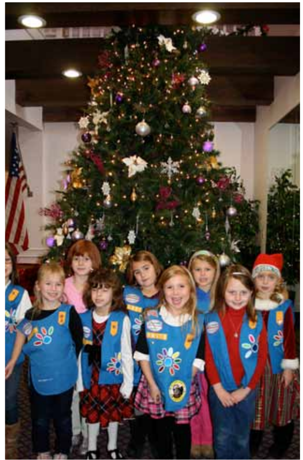
Daisy Troop #40411 sings at the retirement facility.