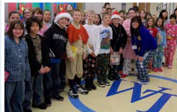
WT principal and students enjoy "Jammie Day."