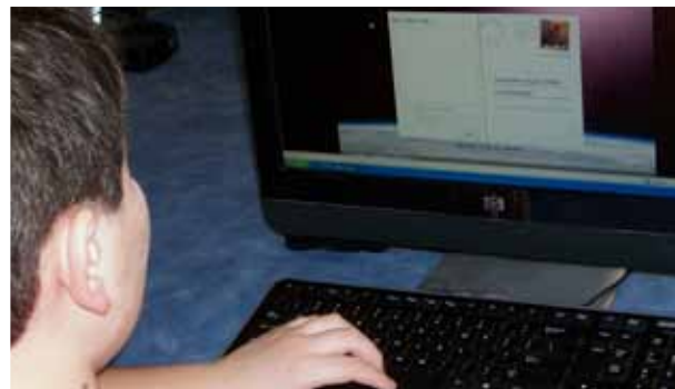
Electronic cards are sent to Expedition crew members.