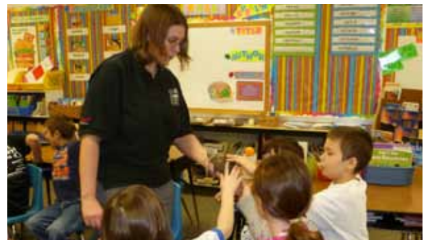
Zoo Outreach visits Holly Hill Elementary.

Holly Hill Elementary had two more Zoo visitors. A red shoulder hawk came to school along with a turtle. Students enjoyed learning about the habitat and life of the hawk. The turtle was very active and friendly to everyone. The Zoo Outreach program is very educating and entertaining. They will be visiting several more times with different animals. So far we have had a screech owl, corn snake, hedgehog, hawk and turtle. Can't wait to see who is coming next!