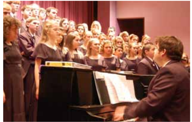
A choir representing several West Clermont singing groups performed at the sampler.