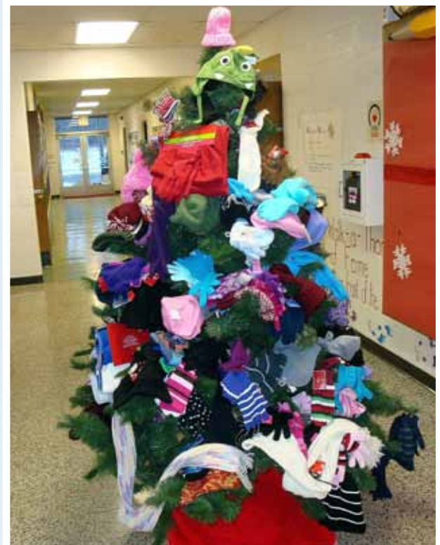
The Christmas tree at Willowville Elementary was laden with gifts of warmth for the Woman's and Children's Shelter. Over 200 items were collected.