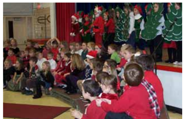
First grade cast and bell choir.