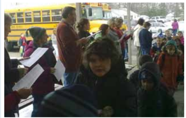
Willowville students were greeted by singing staff members!