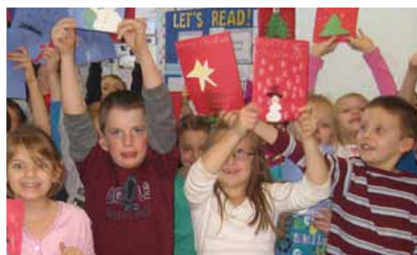
Excited second graders prepare to mail their “Hero Letters.”