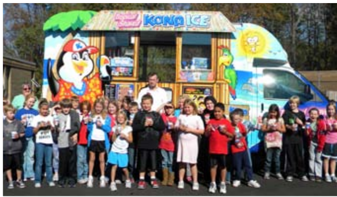
A Kona Ice treat on a hot afternoon!