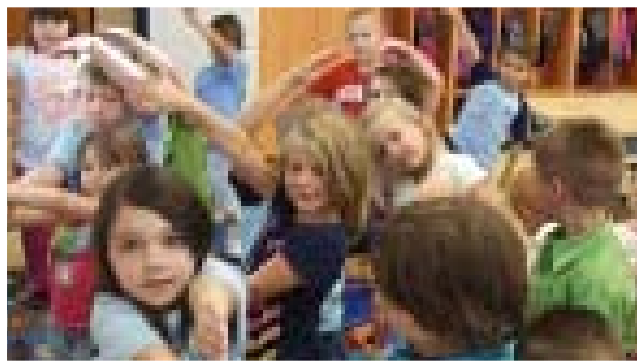
Amelia kindergarten students get twisted up in their letter making.