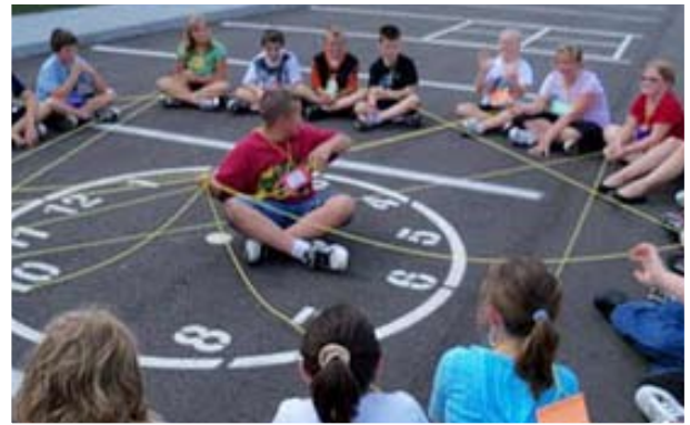
Students make their own food chain to demonstrate how food chains interact and become food webs.