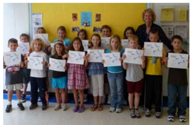
Holly Hill Elementary Student of the Month honorees.