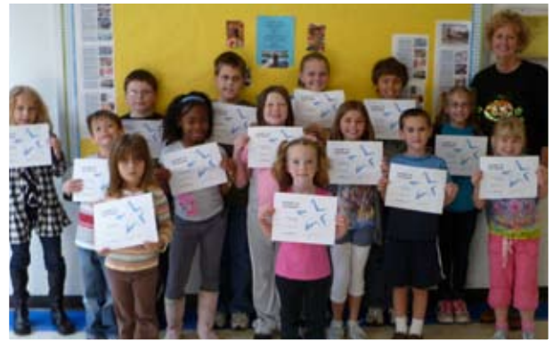
October Student of the Month participants.