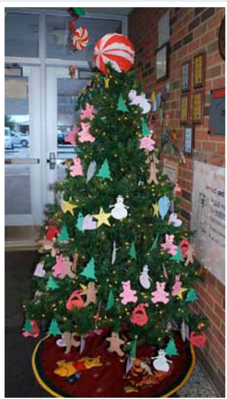
Clough Pike’s Giving Tree.