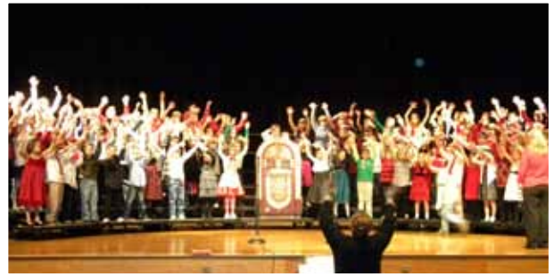
The Merwin third grade recently performed their annual Christmas Musical.