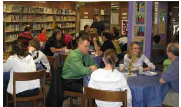
Students of the Month honored at breakfast event.