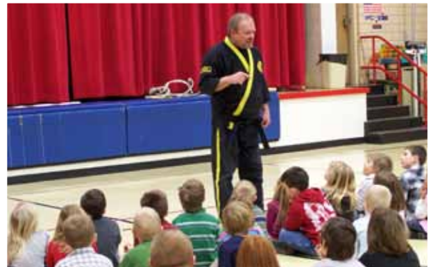
Summerside students enjoy a karate demonstration thanks to the PTO.