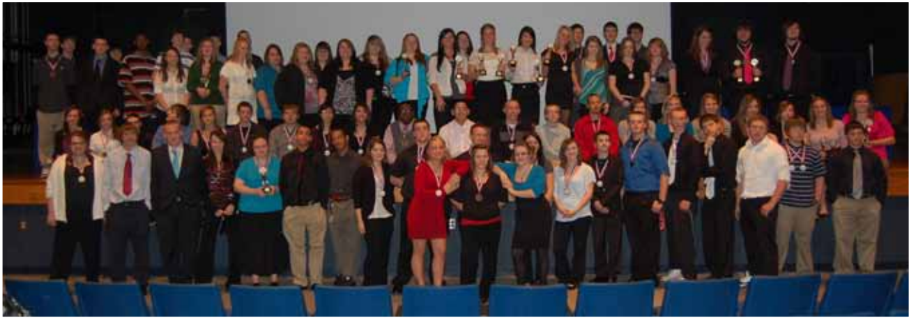
Business Professionals of America awards ceremony