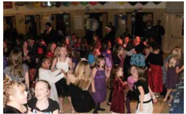
Winter Wonderland Father and Daughter Dance.