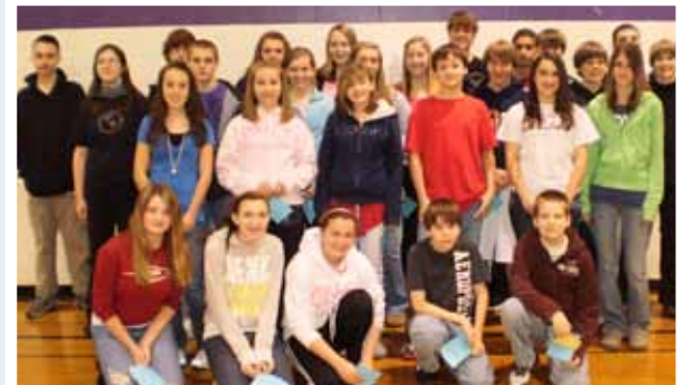
GEMS eighth grade gold card students.