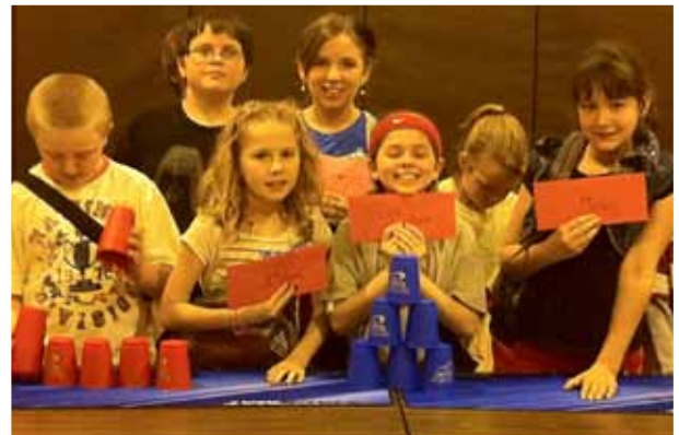
Seventeen Holly Hill students from the third, fourth and fifth grades qualified for the championship.