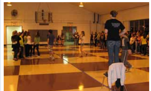
GEMS students play the Power Shuffle.