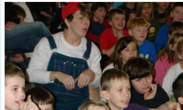
Art Reach brings Children's Theater to Merwin Elementary.