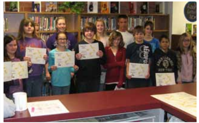
GEMS January Students of the Month. GEMS February Students of the Month.