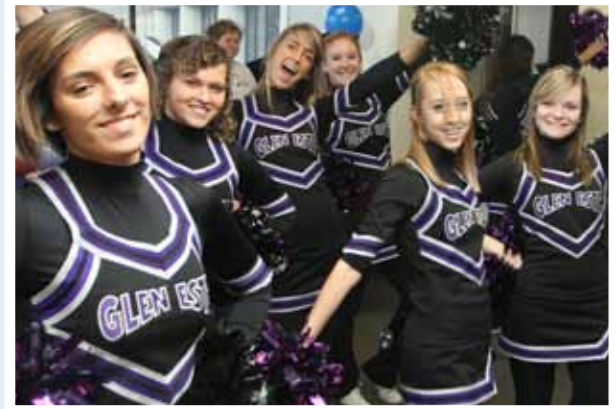
GEHS cheerleaders help celebrate the grand re-opening.