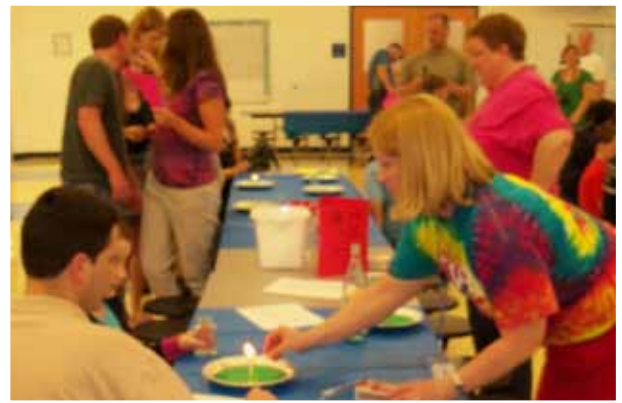
AE Family Science Night.