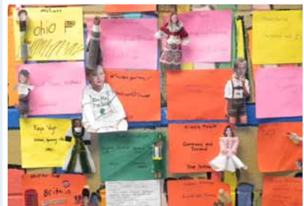
Willowville Elementary third grade students display their projects about their family's ancestors.