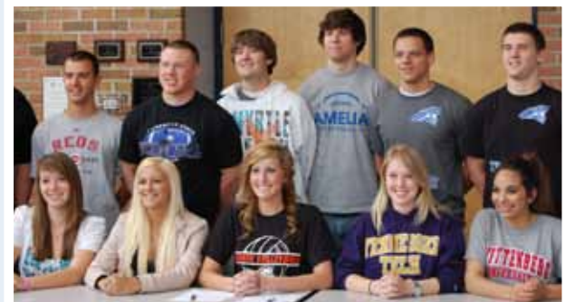
Amelia High School athletic signing.