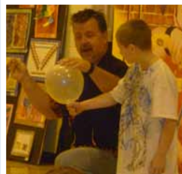
Holly Hill students celebrate their hard work and efforts to do their best on the test.