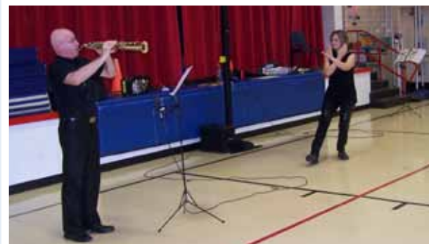
Bach to Beatles performs for Summerside students.