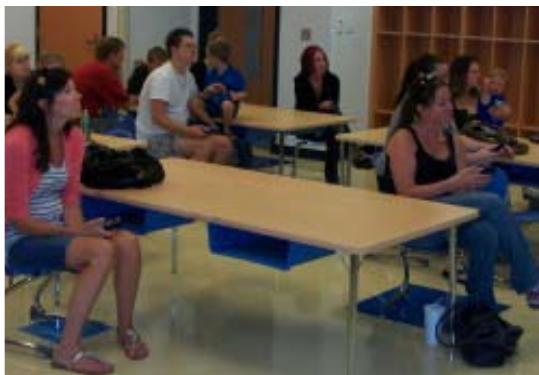
Amelia Elementary parents participate in a technology night.