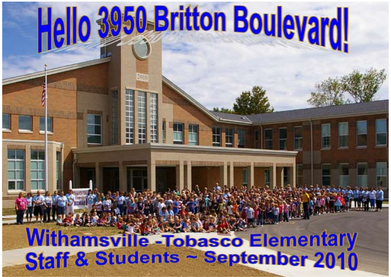
Withamsville-Tobasco Elementary students and staff gather outside their new building for a group photo.