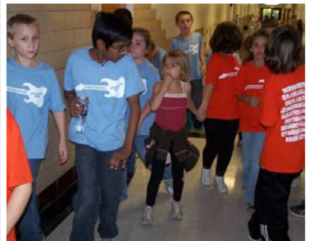
Summerside students prepare for Walk-A-Thon.