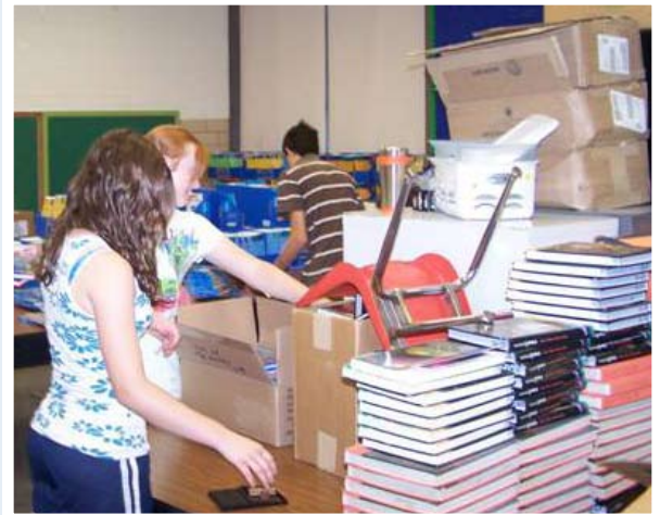
The Lifestream Christian Church Youth Group helped complete the book stamping project.