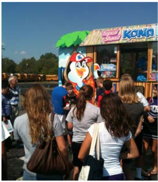
Glen Este freshmen enjoyed a cool treat on a hot day, while spending a little time getting to know their classmates.